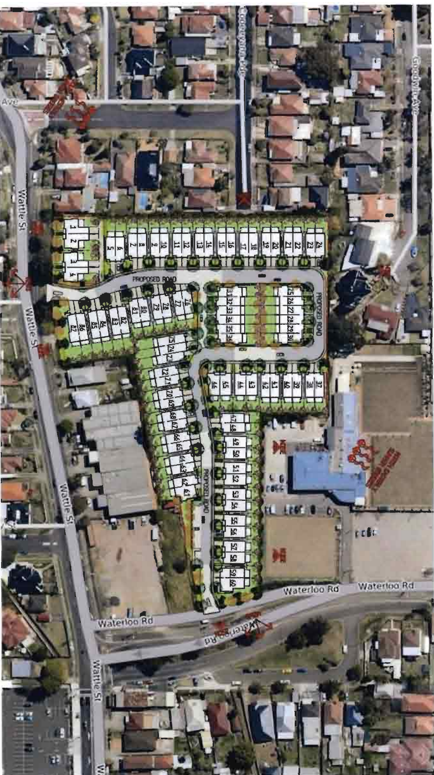
SITE ANALYSIS PLAN 1:1000 POST DEVELOPMENT