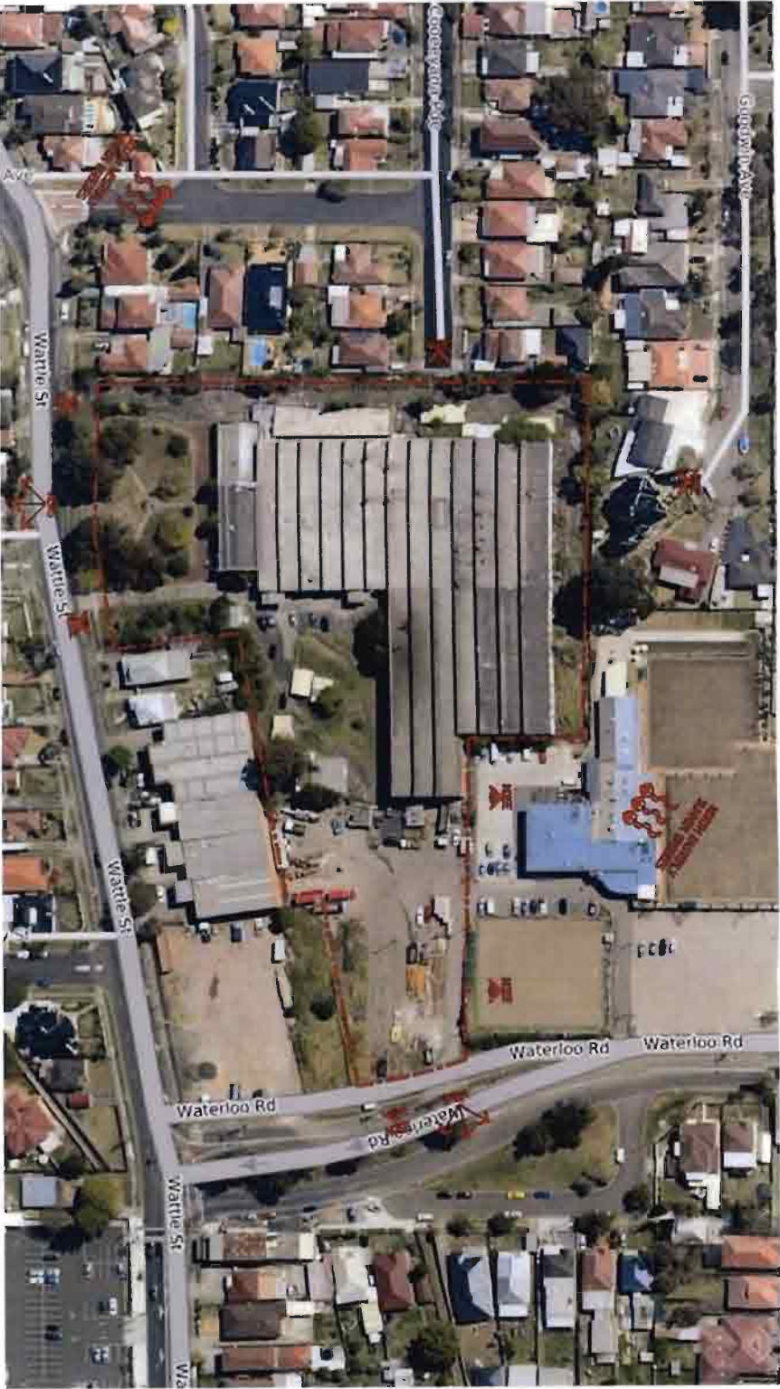
SITE ANALYSIS PLAN 1:1000 PRE DEVELOPMENT